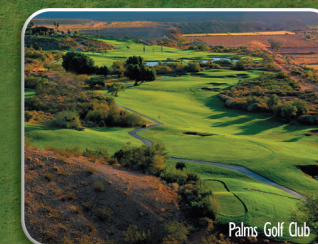
Palms Golf Club