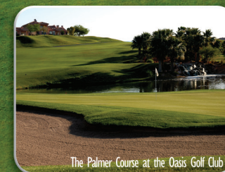
The Palmer Course at the Oasis Golf Club