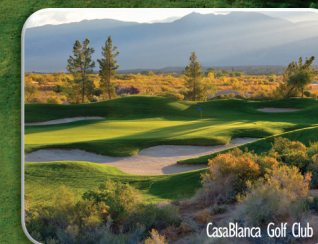
CasaBlanca Golf Club